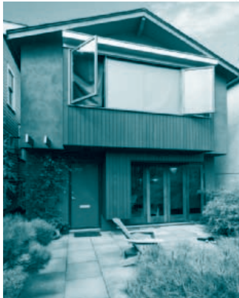
The award winning Lakewood Residence will be among the Vancouver Specials open to ticket holders on Saturday September 25th

LOOK BEYOND THE FENCE! GET inspired, educated & inside FOUR RENOVATED VANCOUVER SPECIALS; DIFFERENT HOMES FROM THOSE OPENED ON THE INAUGURAL 2009 TOUR