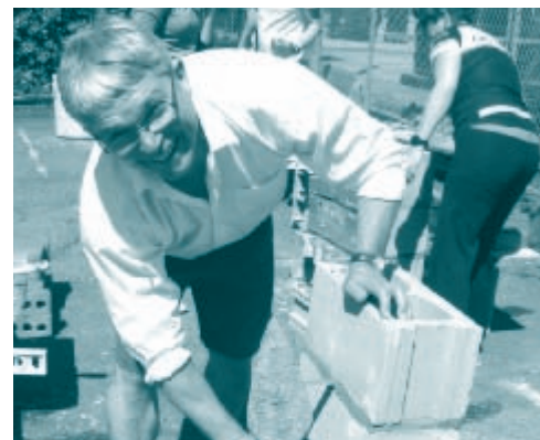
Participant in the May 2010 hands-on masonry course had fun building a brick wall.

> APRIL 16TH 2011; 9 am - 5 pm / $100 > Mission to Seafarers