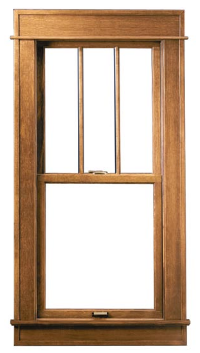
If your windows must be replaced and preserving the character of your house is important, consider a product like Andersen's Woodwright windows. Prices start around $600 per unit.