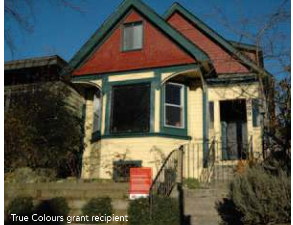
True Colours grant recipient