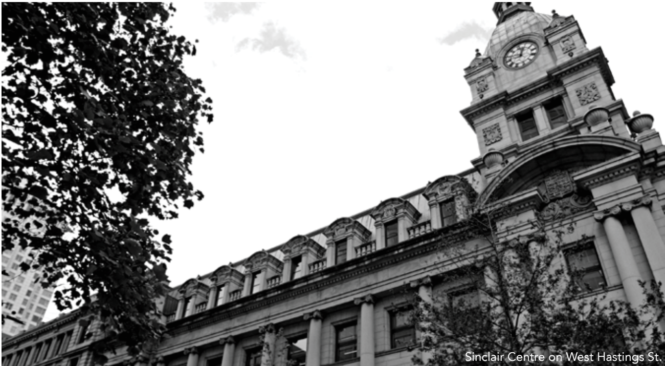
Sinclair Centre on West Hastings St.