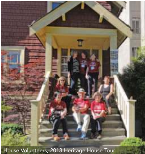
House Volunteers, 2013 Heritage House Tour

2013 was another year with new volunteer opportunities. VHF is immensely grateful to the over 235 volunteers who supported the house tours. For the first time the Mid-Century Modern House Tour required the assistance of volunteers, and Film Nights at the Hollywood required volunteers to guide over a thousand patrons to seats and provide popcorn and snacks. Volunteers continued to take advantage of free seats offered to Old School Courses, Brown Bag Lunch & Learn talks, and Evening Lectures at Hycroft. VHF would also like to thank those who offered their professional knowledge on committees and on the Board of Directors.