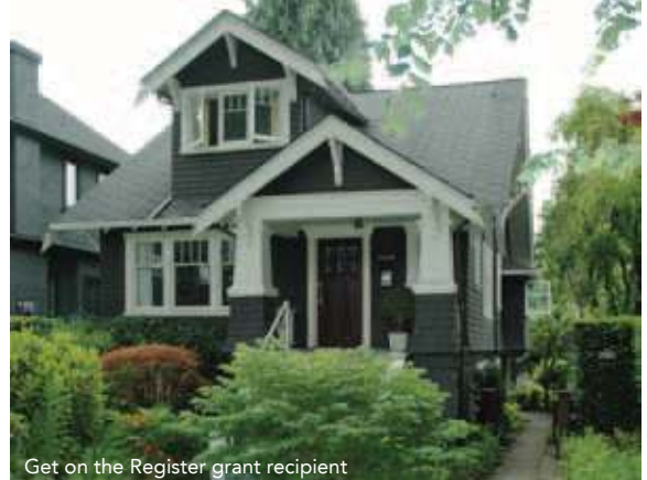
Get on the Register grant recipient