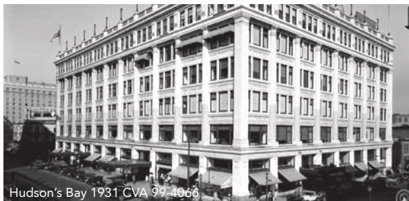
Hudson's Bay 1931 CVA 99-4066

Brown Bag Lunch & Learn talks bring in speakers who offer an in-depth insight into current heritage projects through illustrated talks, from their perspectives as working professionals.