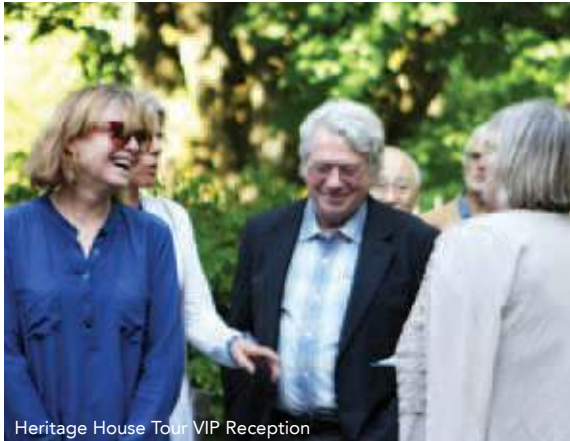
Heritage House Tour VIP Reception