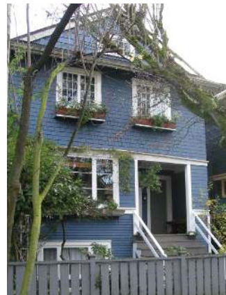
2228 Stephens St Kitsilano Restored original casement wood windows Heritage Register: B Built: 1913