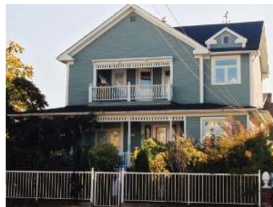
786 E King Edward Ave Riley Park-Little Mountain New drainage system 2004, entry door and sidelites restoration 2005, porches & exterior stairs restoration 2006 Heritage Register: B(M)(H) Built: 1902