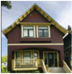
2722 W 7th Ave Williams House Kitsilano Wood shingle repair 2005 Heritage Register: B(M) Built: 1912