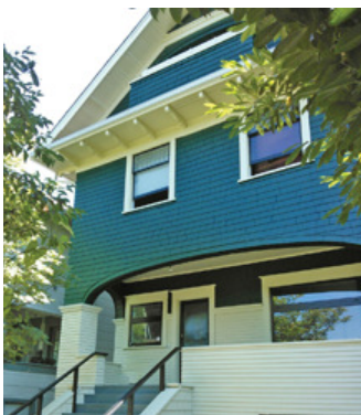
3550 W 1st Ave Kitsilano Sleeping porch, soffit, siding and roofing repairs, 2013 Heritage Register: C Built: 1917