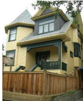
2404 Carolina St Percy House Mount Pleasant New roof Heritage Register: B(M) Built: 1904