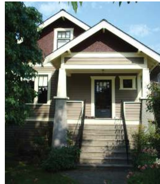
2543 Pandora St Kendrick House Hastings-Sunrise New roof, 2006 Heritage Register: C(M) Built: 1928