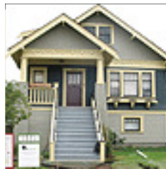
2728 Pandora St Hastings-Sunrise Restoration of front stairs and porch 2004, repair of wood window 2007 Heritage Register: C Built: 1927