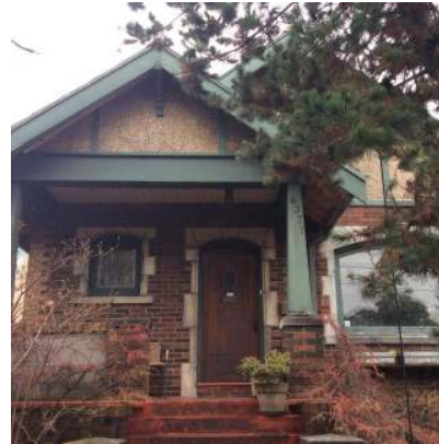
4371 Victoria Drive Mount Pleasant Style: Craftsman Roof replacement Heritage Register: B Built: 1930