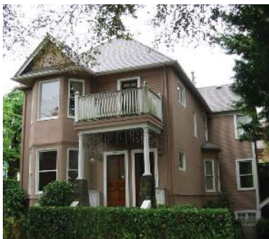
2647 Manitoba St. Ladner House Mount Pleasant New roof, 2003 Heritage Register: B