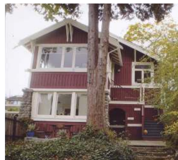
3996 W 10th Ave Point Grey Chimney restoration, 2007 Heritage Register: B Built: 1913