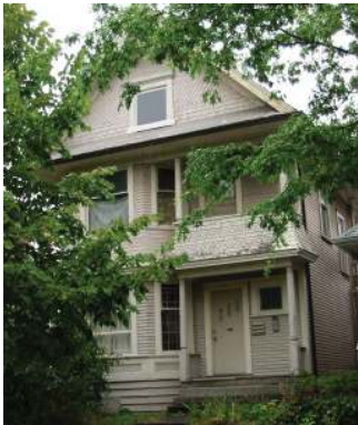
641 E Georgia St. Strathcona New roof, 2003 Heritage Register: B