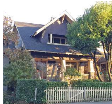
2538 Balaclava St Kitsilano Style: Craftsman Roof replacement Heritage Register: C Built: 1912