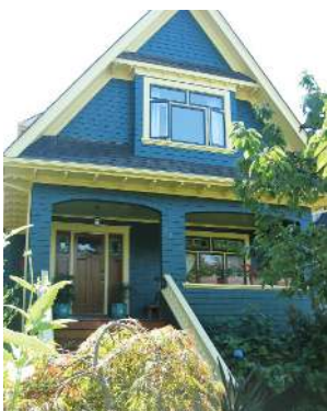
2650 W 5th Ave Straight House Kitsilano Cedar roof shingle replacement, 2006 Heritage Register: C(M)