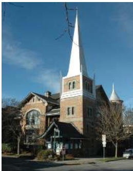
2525 Quebec St Evangelistic Tabernacle Mount Pleasant Original wood window restoration Heritage Register: A(M) Built: 1909 Architects: Parr & Fee