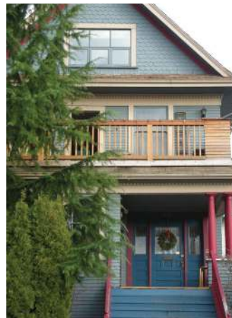
906 Salsbury Dr Pilling House Grandview-Woodlands Sleeping porch restoration, 2009 Heritage Register: C(M)