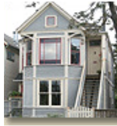
751 - 755 Keefer St Manson's Duplex Strathcona Restoration of front siding 2004, repair of wood window 2005 Heritage Register: B(M) Built: 1899