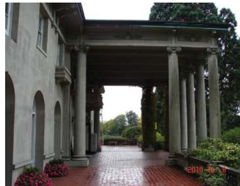
1489 McRae Ave Hycroft House First Shaughnessy Style: Classical Revival Roof repairs Heritage Register: A Built: 1909-11 Architect: Thomas Hooper