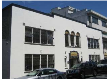
475 Alexander St Japanese Hall Oppenheimer-Downtown Eastside Metal pivot window restoration, 2012 Heritage Register: B(M) Built: 1906