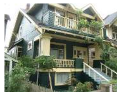
2239 Stephens St Lukov House Kitsilano Repair of wood shingles and wood windows, 2004 Heritage Register: B(M) Built: 1917