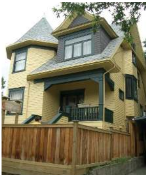
2404 Carolina St Percy House Mount Pleasant Stained glass window repair 2005, wood window repairs 2006, chimney restoration 2008 Heritage Register: B(M) Built: 1904