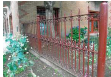
101 E 7th Ave Quebec Manor Mount Pleasant Iron railing restoration and repairs, 2012 Heritage Register: A Built: 1910-11