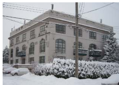
4590 Earles St Earles Road Substation Renfrew-Collingwood Concrete siding repairs, 2009 Heritage Register: B

Restore It! is a grant program created by Vancouver Heritage Foundation. Buildings on the Vancouver Heritage Register are eligible to receive funds from VHF to restore, maintain and repair the original historic fabric of buildings' exteriors. VHF grants provide support to heritage building owners for the maintenance, restoration, repair and rehabilitation of their buildings. The grant application deadline for all grants is February 1st of every year.