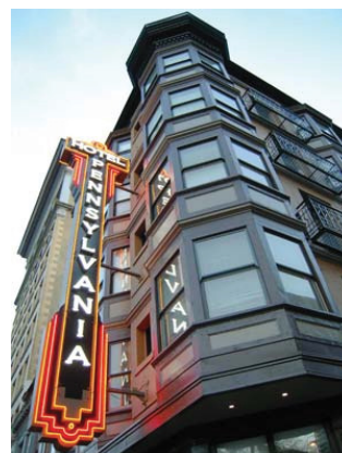
412 Carrall St Woods/Pennsylvania Hotel Downtown Eastside Neon sign replication, 2008 Heritage Register: B(M)(H) Built: 1906

Restore It! is a grant program created by Vancouver Heritage Foundation. Buildings on the Vancouver Heritage Register are eligible to receive funds from VHF to restore, maintain and repair the original historic fabric of buildings' exteriors. VHF grants provide support to heritage building owners for the maintenance, restoration, repair and rehabilitation of their buildings. The grant application deadline for all grants is February 1st of every year.