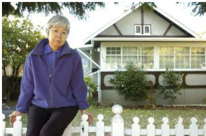
1450 W 64th Ave Joy Kogawa House Marpole New roof, 2011 Heritage Register: B Built: 1912