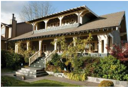
2925 W 38th Ave Dunbar Rafter tail and sleeping porch repairs, 2011 Heritage Register: B Built: 1914