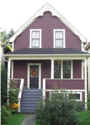
1962 W 2nd Ave Faulkner House Kitsilano Wood siding repairs 2009, front stair restoration 2011 Heritage Register: C Built: 1908