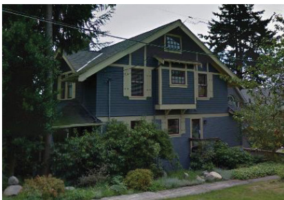
5825 Carnarvon St Simpson House Kerrisdale Sewer line repair, 2011 Heritage Register: C(H) Built: 1919