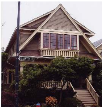
1476 Graveley St Marchese House Grandview-Woodlands New roof, 2008 Heritage Register: B(M)