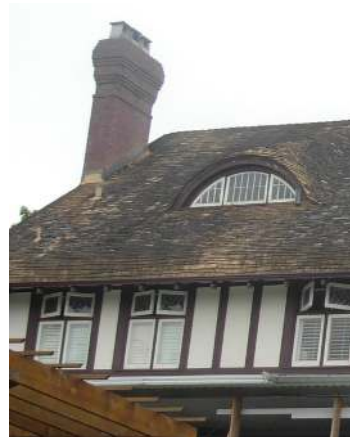
5055 Connaught Dr Brooks House 3rd Shaughnessey Replacement rolled shingle roof, 2008 Heritage Register: A(M)(H)(L)