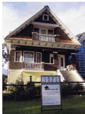
2439 Eton St Bergquist House Hastings-Sunrise New shingle roof 2004, front porch and sleeping porch restoration 2007 Heritage Register: B(M)(H) Built: 1911

Restore It! is a grant program created by Vancouver Heritage Foundation. Buildings on the Vancouver Heritage Register are eligible to receive funds from VHF to restore, maintain and repair the original historic fabric of buildings' exteriors. VHF grants provide support to heritage building owners for the maintenance, restoration, repair and rehabilitation of their buildings. The grant application deadline for all grants is February 1st of every year.