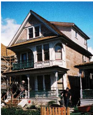
1157 - 1169 Pendrell St Mole Hill Restoration of lost Victorian detailing on four houses including Paterson House , 2003 Heritage Register: B