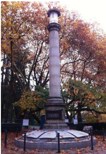
Japanese Canadian War Memorial, Stanley Park Stonework, masonry and plaque restoration work Heritage Register: Monument Built: 1920