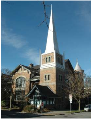
2525 Quebec St Evangelistic Tabernacle Mount Pleasant Style: Gothic Revival Original wood window restoration (ongoing restoration project) Heritage Register: A(M) Built: 1909 Architects: Parr & Fee