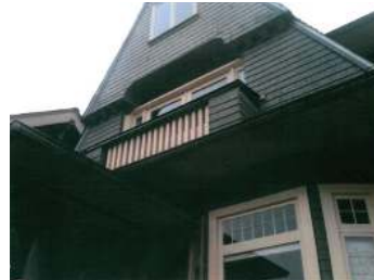
2648 Point Grey Rd Kitsilano Soffit and porch repairs, 2012 Heritage Register: B