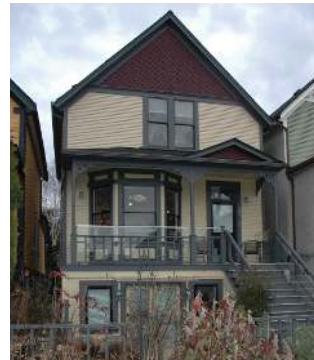
827 E Georgia St Hendrix House Strathcona Restoration of front porch and stairs, 2007 Heritage Register: C(M) Built: 1904