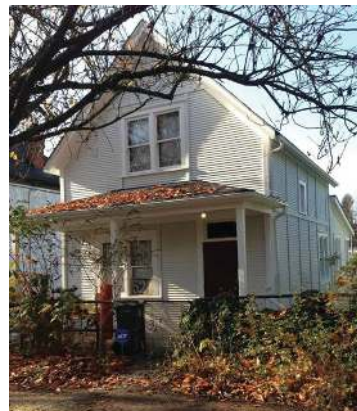
521 Hawks Ave BC Mills Prefab Demonstration House Strathcona Siding repairs and porch restoration, 2012 Heritage Register: B Built: 1903