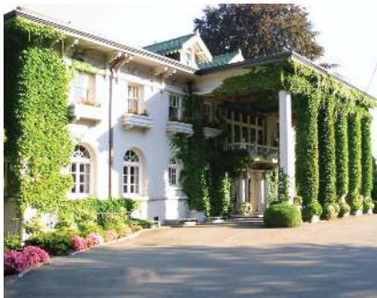
1489 McRae Ave Hycroft Shaughnessy Heights Restore the North exterior balustrads and staircase, 2003 Heritage Register: A(M)(L)