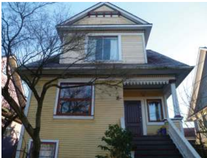
2714 Carolina St Mount Pleasant New gutters, 2011 Heritage Register: C Built: 1900-05