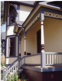
844 Dunlevy Ave Winchcombe House Strathcona Wood window repairs 2005, front and back porch restorations 2006 Heritage Register: B(M)