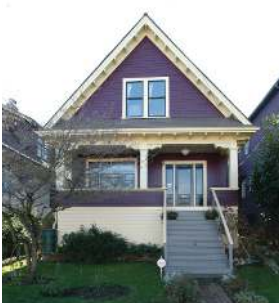
1932 Ferndale St Grandview-Woodlands New roof, 2008 Heritage Register: C(M)