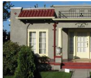
3409 Arbutus St Curry Residence Arbutus Ridge Wood window replication, 2009 Heritage Register: B(M)(H)