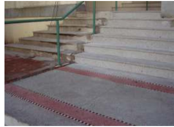
868 Cassiar St Industrial Girls School Grandview-Woodland Terazzo stair restoration, 2011-12 Heritage Register: A(M) Built: 1914