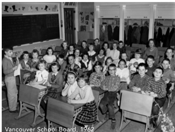
Vancouver School Board, 1962

VHF is working with local educators to develop an online Heritage Study Guide to engage young learners in Vancouver's diverse local history and heritage places. The guide will include lesson plans and resources, project and field trip ideas for Grades 4-5 and 9-11 Social Studies, tied to the BC Curriculum.