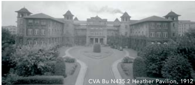
Heather Pavilion, 1912

Thank you to event partner The University Women's Club of Vancouver