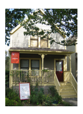
504 Hawks Ave

Trim: Edwardian Porch Grey VC-26 Sash: Strathcona Mahogany VC-34 Door: Victorian Peridot VC-17