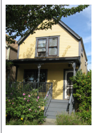
516 Hawks Ave

Year Painted: 2006 Style: Victorian Built: 1898