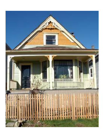
1145 Union St

Sash: Strathcona Mahogany VC-34 Door: Strathcona Mahogany VC-34