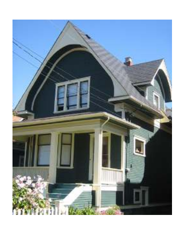
4446 James St

Painted: 2007 Style: Edwardian Built: 1910