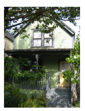
508 Hawks Ave

Sash: Strathcona Mahogany VC-34 Door: Strathcona Red VC-27