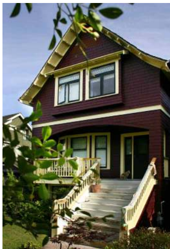
2722 W 7th Ave Painted: 2005 Style: Vancouver Craftsman Built: 1912 Heritage Register: B(M)

Body: Hastings Red VC-30 Trim: Edwardian Buff VC-6 Sash: Gloss Black VC-35