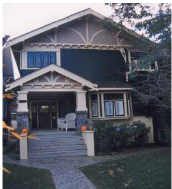
3622 W 3rd Ave Painted: 2001 Style: Vancouver Craftsman Built: 1912 Heritage Register: B

Body: Harris Green VC-21 Trim: Harris Cream VC-4 Sash: Comox Green VC-19 Stucco & Base Siding: Gloss Black VC-35