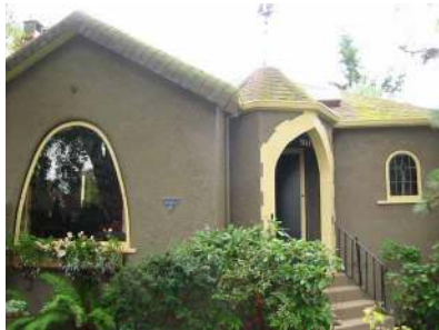
3143 Crown St Painted: 2003 Style: Storybook Built: 1941 Heritage Register: C Body: Bute Taupe VC-13 Trim: Edwardian Buff VC-6 Sash: Gloss Black VC-35