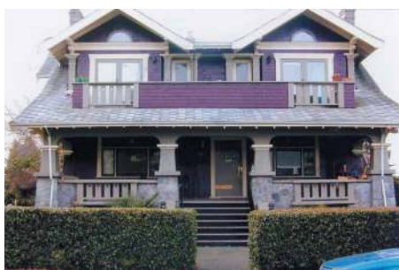
1641/1661 Dunbar St Painted: 1999 Style: Craftsman Built: 1912 Heritage Register: B

Body: Kitsilano Gold VC-11 Upper Body Shingles: Comox Green VC-19 Trim: Kitsilano Gold VC-11 Sash: Gloss Vancouver Green VC-20 Stucco: Haddington Grey VC-15