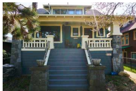
3044 Point Grey Rd Painted: 2016 Style: Craftsman Built: 1922 Heritage Register: B

Body: Edwardian Pewter VC - 23 Trim: Oxford Ivory VC - 1 Sash: Gloss Black VC - 35 Door: Clear varnish