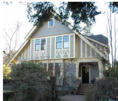
5629 Angus Dr Painted: 2002 Style: Arts & Crafts Built: 1926 Heritage Register: A

Body: Point Grey VC-24 Body Upper Shingles: Edwardian Pewter VC-23 Trim: Edwardian Cream VC-7 Sash: Gloss Hastings Red VC-30