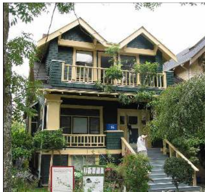
2239 Stephens St Painted: 2004 Style: Vancouver Craftsman Built: 1917 Heritage Register: B

Body: Hastings Red VC-30 Trim: Edwardian Buff VC-6 Sash: Gloss Black VC-35