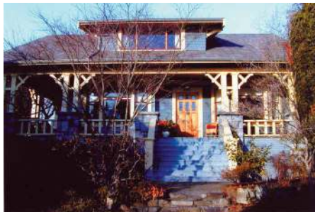
3223 W 37th St Painted: 2000 Style: Craftsman Built: 1912 Heritage Register: B

Body: Point Grey VC-24 Body Upper Shingles: Edwardian Pewter VC-23 Trim: Edwardian Cream VC-7 Sash: Gloss Hastings Red VC-30