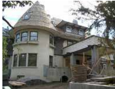
3838 Cypress St Painted: 2003 Style: Arts & Crafts Built: 1912 Heritage Register: A (restoration and painting in progress photo)