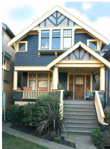
2622 W 5th Ave Painted: 1999 Style: Vancouver Craftsman Built: 1914 Heritage Register: B

Body: Edwardian Buff VC-6 Upper Body Shingles: Harris Green VC-21 Trim: Edwardian Buff VC-6 Sash: Gloss Black VC-35 Stucco & Porch: Haddington Grey VC-15