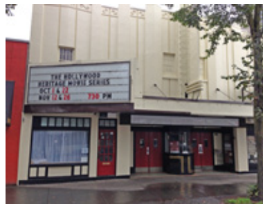
3123 W Broadway The Hollywood Theatre Painted 2013 Built: 1935 Heritage Register: B

Body: Verdigris VC-22 Trim: Vancouver Green VC-20 Sash and Door: Strathcona Red VC-27