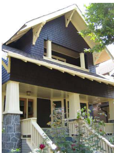
2538 Balaclava St Painted: 2006 Style: Craftsman Built: 1912 Heritage Register: C

Body: Hastings Red VC-30 Trim: Edwardian Cream VC-7 Sash & Door: Gloss Black VC-35 Gable Shingles: Strathcona Mahogany VC-34