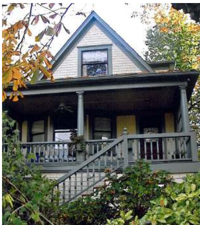
1928 Stephens St Painted: 2011 Style: Edwardian Built: 1908 Heritage Register: C

Body: Dunbar Buff VC-5 Trim: Pendrell Verdigris Sash: Hastings Red VC-30