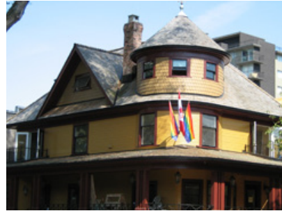
995 Bute St (Rand House) Painted: 2005 Style: Queen Anne Revival Built: 1896 Heritage Register: B

Body: Victorian Peridot VC-17 Trim: Pendrell Green VC-18 Sash: Hastings Red VC-30 Fish Scale Shingles: Pendrell Red VC-29