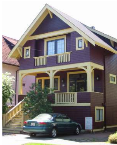
2622 W 7th Ave Painted: 2006 Style: Vancouver Craftsman Built: 1912 Heritage Register: C

Body: Hastings Red VC-30 Trim: Oxford Ivory VC-1 Sash: Gloss Black VC-35 Porch: Edwardian Porch Grey VC-26