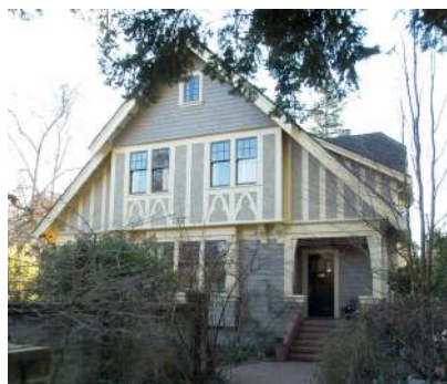
5629 Angus Dr Painted: 2002 Style: Arts & Crafts Built: 1926 Heritage Register: A

Body: Point Grey VC-24 Body Upper Shingles: Edwardian Pewter VC-23 Trim: Edwardian Cream VC-7 Sash: Gloss Hastings Red VC-30