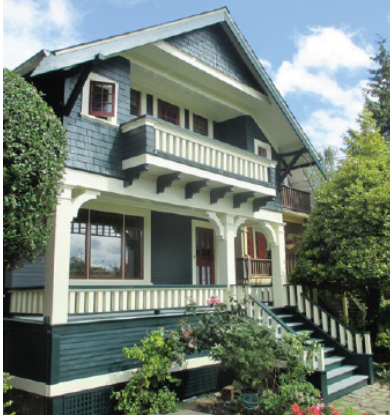
1642 Stephens St Painted: 2016 Style: Craftsman Built: 1912 Heritage Register: B

Body: Comox Green VC-19 Shingles: Vancouver Green VC-20 Trim: Oxford Ivory VC-1 Sash and Doors: Hastings Red VC-30