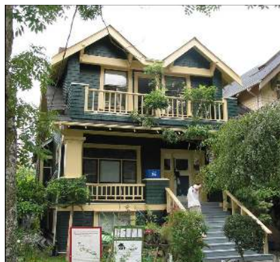
2239 Stephens St Painted: 2004 Style: Vancouver Craftsman Built: 1917 Heritage Register: B

Body: Hastings Red VC-30 Trim: Edwardian Buff VC-6 Sash: Gloss Black VC-35