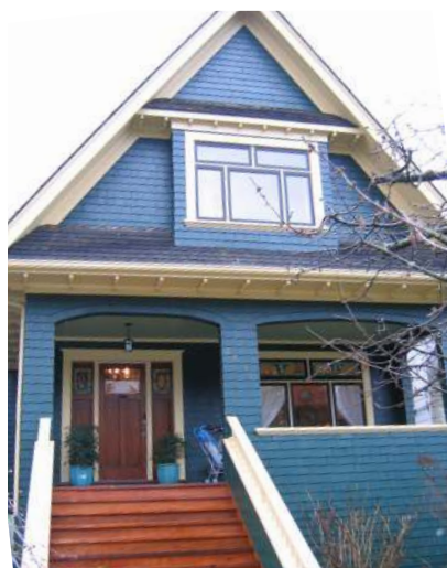
2650 W 5th Ave Painted: 2005 Style: Vancouver Craftsman Built: 1910 Heritage Register: C

Body: Haddington Grey VC-15 Body Shingles: Mellish Mahogany VC-31 Trim: Edwardian Buff VC-6 Sash: Gloss Black VC-35 Porch: Edwardian Pewter VC-23