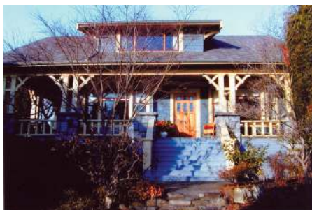
3223 W 37th St Painted: 2000 Style: Craftsman Built: 1912 Heritage Register: B

Body: Point Grey VC-24 Body Upper Shingles: Edwardian Pewter VC-23 Trim: Edwardian Cream VC-7 Sash: Gloss Hastings Red VC-30