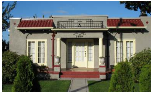
3409 Arbutus St Painted: 2009 Style: Spanish Revival Built: 1930 Heritage Register: B (Arbutus Ridge neighbourhood)

Body: Dunbar Buff VC-5 Trim: Pendrell Verdigris Sash: Hastings Red VC-30