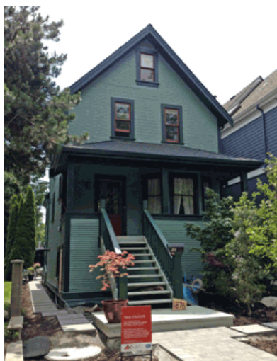
1876 W 3rd Ave Painted: 2014 Style: Edwardian Built: 1913 Heritage Register: C

Body: Hastings Red: VC-30 Trim: Edwardian Buff VC-6 Sash: Gloss Black VC-35