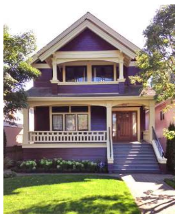
4446 W 5th Ave Painted: 2014 Style: Craftsman Built: 1912 Heritage Register: B

Body: Comox Green VC-19 Shingles: Vancouver Green VC- 20 Trim: Oxford Ivory VC- 1 Sash and Doors: Hastings Red VC-30