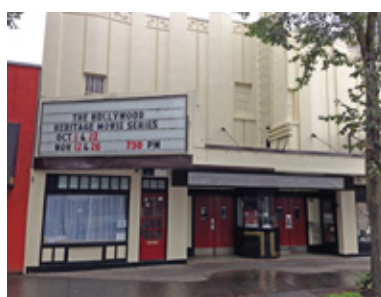
3123 W Broadway The Hollywood Theatre Painted 2013 Built: 1935 Heritage Register: B

Body: Verdigris VC-22 Trim: Vancouver Green VC-20 Sash and Door: Strathcona Red VC-27