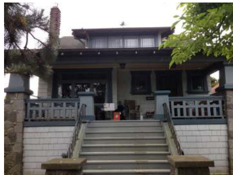
3044 Point Grey Rd Painted: 2016 Style: Craftsman Built: 1922 Heritage Register: B

Body: Edwardian Pewter VC - 23 Trim: Oxford Ivory VC - 1 Sash: Gloss Black VC - 35 Door: Clear varnish