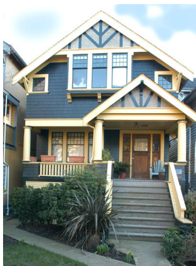
2622 W 5th Ave Painted: 1999 Style: Vancouver Craftsman Built: 1914 Heritage Register: B

Body: Edwardian Buff VC-6 Upper Body Shingles: Harris Green VC-21 Trim: Edwardian Buff VC-6 Sash: Gloss Black VC-35 Stucco & Porch: Haddington Grey VC-15