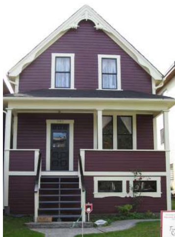
1962 W 2nd Ave Painted: 2009 Style: Edwardian Built: 1908 Heritage Register: C

Body stucco: Haddington Grey VC-15 Window & door trim, columns, sash: Oxford Ivory VC-1 Downspouts, decorative sills and brick, pantile roof tiles: Strathcona Red VC-27 Wrought iron railings: Gloss Black VC-35 Beam end brackets: Vancouver Green VC-20