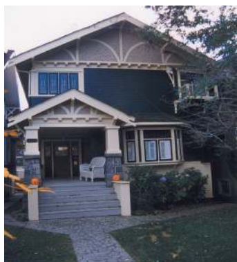
3622 W 3rd Ave Painted: 2001 Style: Vancouver Craftsman Built: 1912 Heritage Register: B

Body: Harris Green VC-21 Trim: Harris Cream VC-4 Sash: Comox Green VC-19 Stucco & Base Siding: Gloss Black VC-35