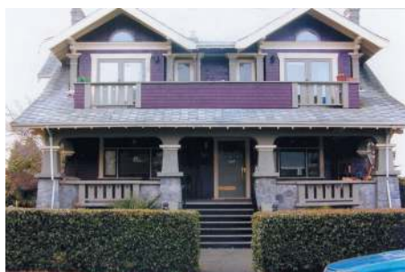
1641/1661 Dunbar St Painted: 1999 Style: Craftsman Built: 1912 Heritage Register: B

Body: Kitsilano Gold VC-11 Upper Body Shingles: Comox Green VC-19 Trim: Kitsilano Gold VC-11 Sash: Gloss Vancouver Green VC-20 Stucco: Haddington Grey VC-15