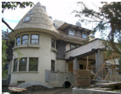
3838 Cypress St Painted: 2003 Style: Arts & Crafts Built: 1912 Heritage Register: A (restoration and painting in progress photo)

Body Shingles: Craftsman Brown VC-32 Trim & Sash: Craftsman Brown VC-32 Stucco: Dunbar Buff VC-5