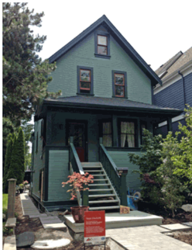
1876 W 3rd Ave Painted: 2014 Style: Edwardian Built: 1913 Heritage Register: C

Body: Hastings Red: VC-30 Trim: Edwardian Buff VC-6 Sash: Gloss Black VC-35