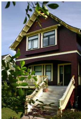
2722 W 7th Ave Painted: 2005 Style: Vancouver Craftsman Built: 1912 Heritage Register: B(M)

Body: Hastings Red VC-30 Trim: Edwardian Buff VC-6 Sash: Gloss Black VC-35