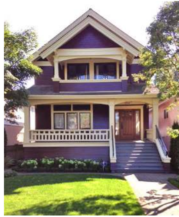
4446 W 5th Ave Painted: 2014 Style: Craftsman Built: 1912 Heritage Register: B

Body: Comox Green VC-19 Shingles: Vancouver Green VC-20 Trim: Oxford Ivory VC-1 Sash and Doors: Hastings Red VC-30