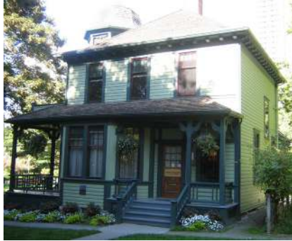
1415 Barclay St (Roedde House) Painted: 2006 Style: Queen Anne Revival Built: 1893 Heritage Register: A

Body: Victorian Peridot VC-17 Trim: Pendrell Green VC-18 Sash: Hastings Red VC-30 Fish Scale Shingles: Pendrell Red VC-29