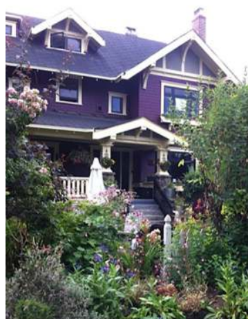
1820 W 10th Ave Painted: 2012 Style: Craftsman Built: 1912 Heritage Register: B

Upper Siding Shingles: Harris Green VC-21 Horizontal Siding, Trim and Soffits: Edwardian Buff VC-6 Sash and Door: Gloss Black