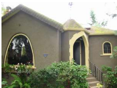
3143 Crown St Painted: 2003 Style: Storybook Built: 1941 Heritage Register: C

Body: Bute Taupe VC-13 Trim: Edwardian Buff VC-6 Sash: Gloss Black VC-35