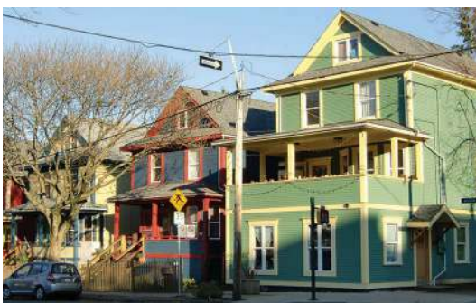
Houses on Jackson Street

For the past two summers, VHF Summer Interns with the help of local authors and historians have been researching and updating our series of historic map guides. Using more recently created publications as inspiration, such as the Historic West Hastings guide, the older guides are being updated and modernized. Currently we are finalizing the Historic Japanese Canadian District guide and the Chinatown guide. Both will include new information as well as updated and new site descriptions and images.