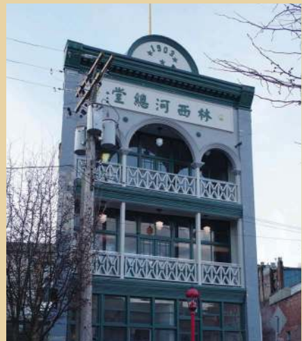
Lim Association Building, 2017 Grant Recipient

In 2018 we have expanded the grant threshold for Restore It and True Colours grants to a maximum of $7,500 (maximum of 50% of the cost of the project) for the right projects. This will allow us to more significantly assist great heritage conservation work. We are also still able to help with listing a site or building on the Vancouver Heritage Register with the Get on the Register grant, or with maintenance and conservation planning through the House Call grant.