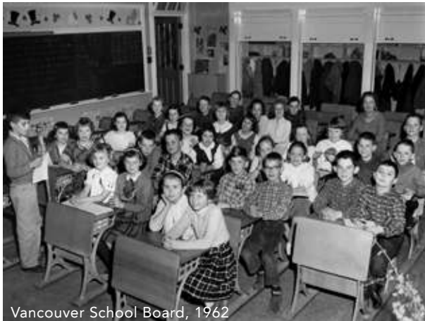
Vancouver School Board, 1962

VHF is working with local educators to develop an online Heritage Study Guide to engage young learners in Vancouver's diverse local history and heritage places. The guide will include lesson plans and resources, project and field trip ideas for Grades 4-5 and 9-11 Social Studies, tied to the BC Curriculum.