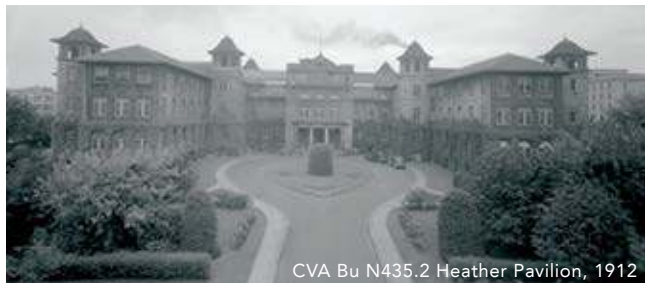
CVA Bu N435.2 Heather Pavilion, 1912

Thank you to event partner The University Women's Club of Vancouver