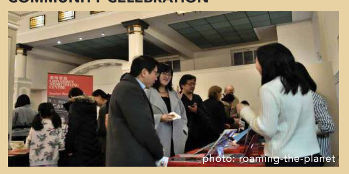
February 19, 6pm - 8:30pm Heritage Hall, 3102 Main Street

Join VHF to learn about the special places recognized in the Places That Matter project, and hear about them from the people and organizations involved in bringing their history forward. This free celebration includes displays from a variety of organizations, institutions and individuals related to Places That Matter sites and local history, a short program of storytelling, as well as live music from bluegrass band, Viper Central and refreshments.