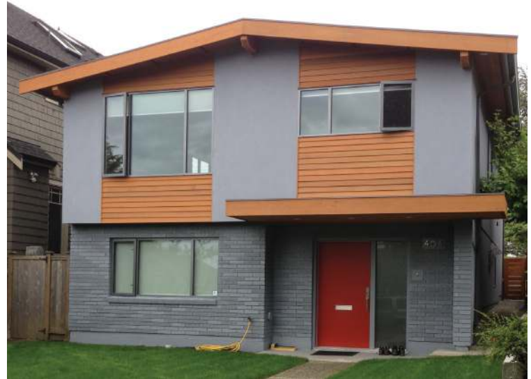
2013 Tour House near Mountain View Cemetery