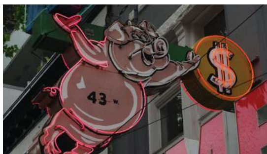
Save On Meats