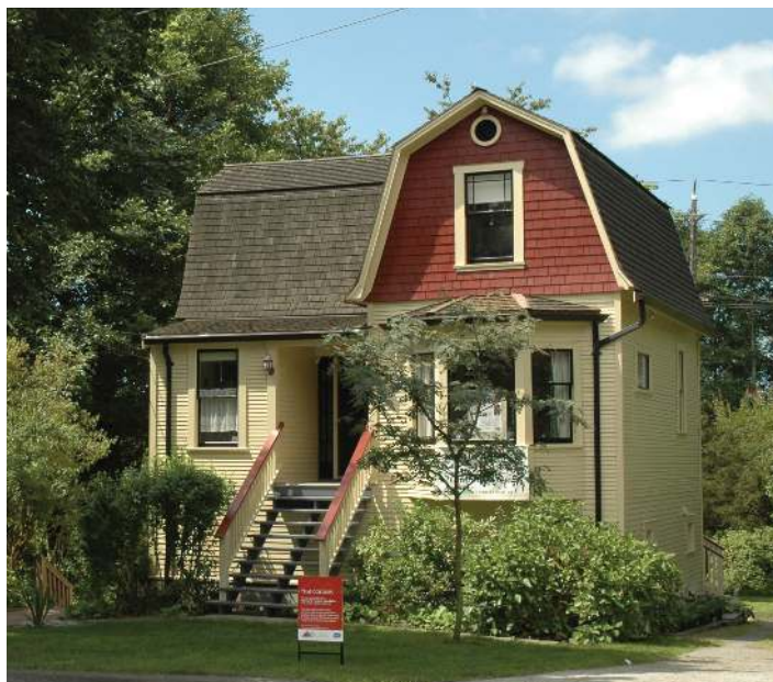
Marpole Museum & Historical Society / Colbourne House repainted in Strathcona Red and Edwardian Buff

www.vancouverheritagefoundation.org/get-a-grant/