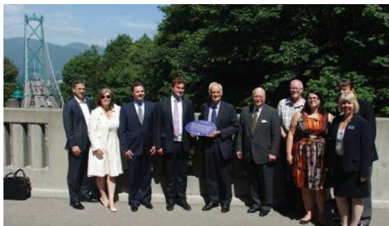
Lions Gate Bridge