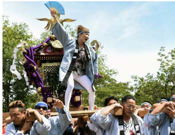
Top Left: African Descent Festival, Vancouver, BC, Top Right: Pinoy Fiesta, Vancouver, BC, Bottom Left: Diwali Festival, Vancouver, BC, Bottom Right: Powell Street Festival, Vancouver, BC