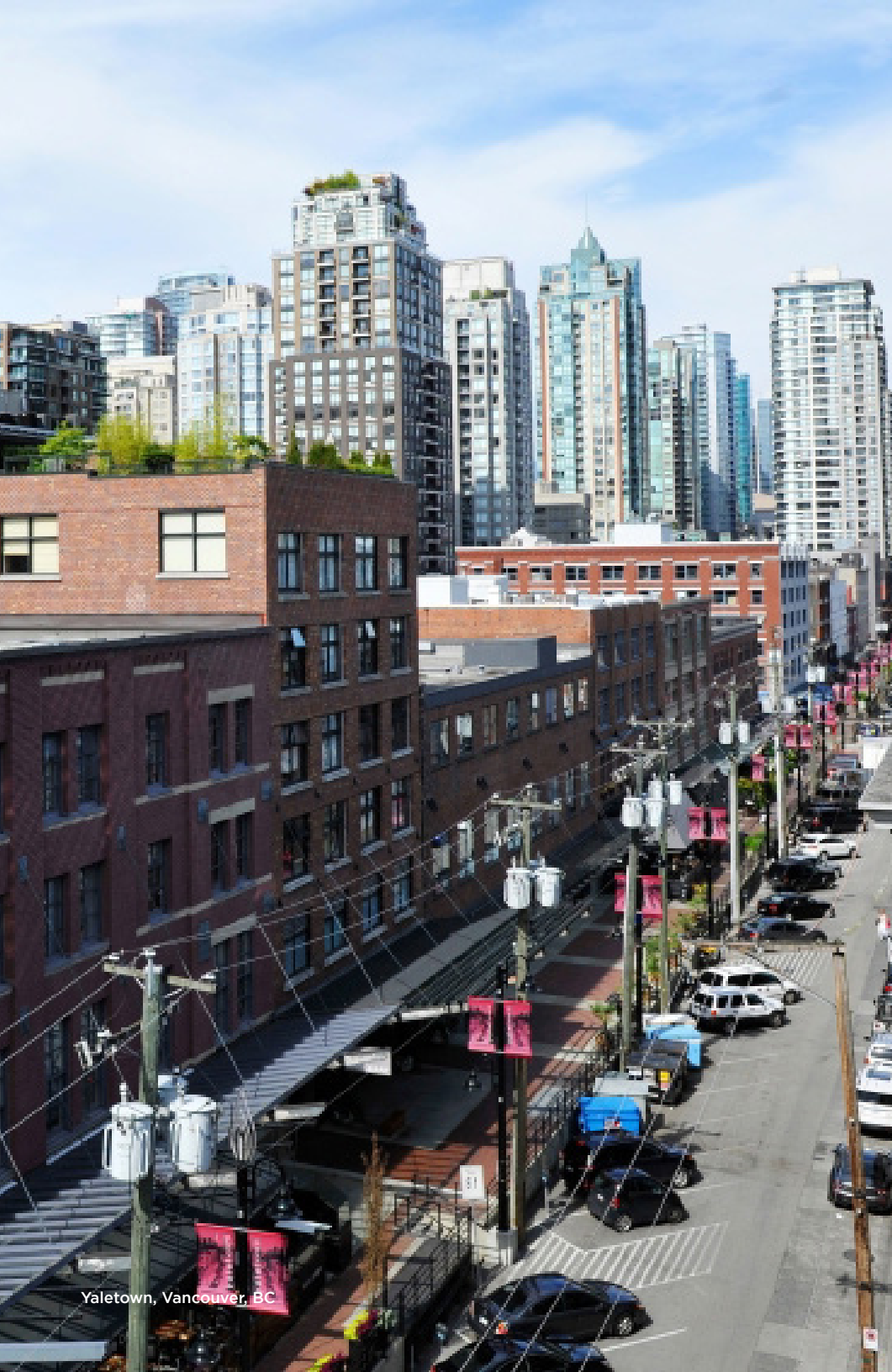
Yaletown, Vancouver, BC