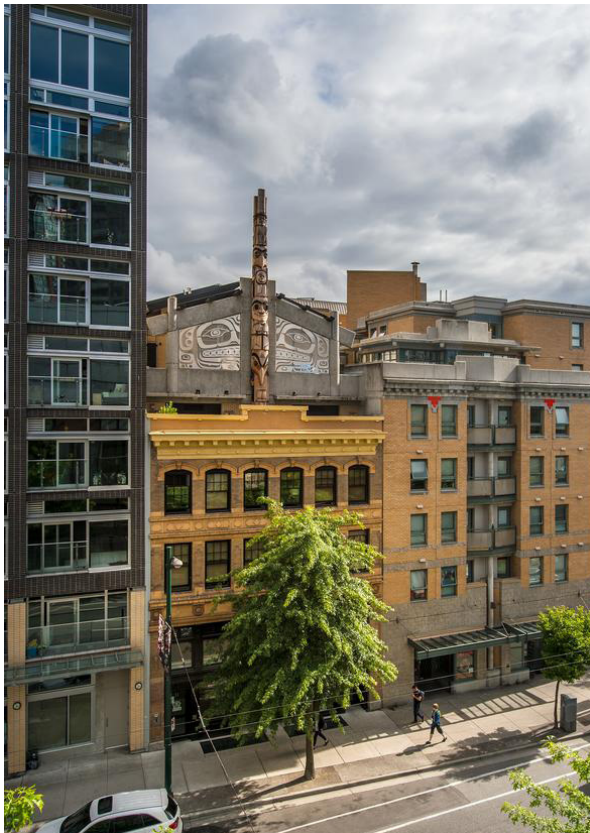
Skwachàys Lodge, Vancouver, BC

Provide leadership through clear and consistent heritage policies, effective heritage management tools, and meaningful heritage conservation incentives.