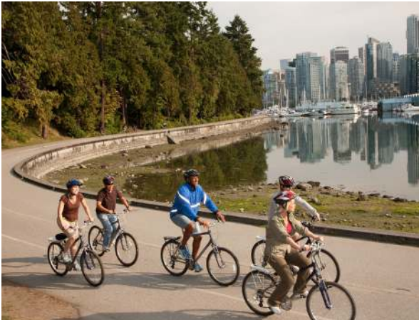
Top: Alhambra, Vancouver, BC. Bottom: Stanley Park Seawall, Vancouver, BC. Right: Gathering of Canoes in False Creek, Vancouver, BC