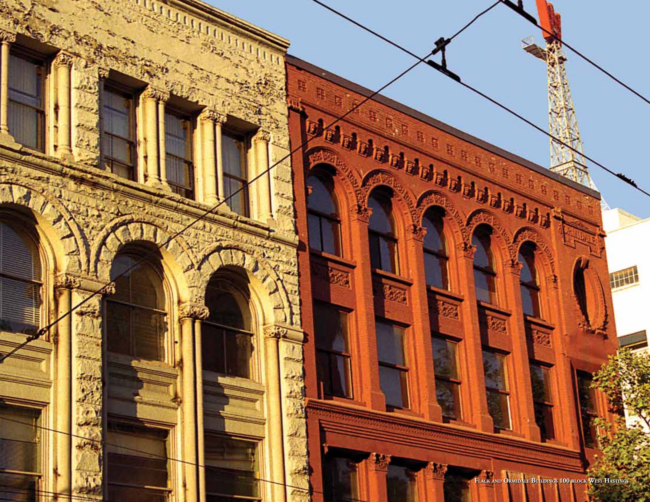
FLACK AND ORMDALE BUILDINGS 100 BLOCK WEST HASTINGS