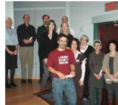
INAUGURAL GRADUATES OF OLD SCHOOL: COURSES FOR BUILDING CONSERVATION.