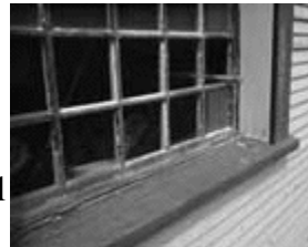
Photo: Damaged Window Sill

If your window sills are severely deteriorated, they can be replaced, preferably by a good carpenter knowledgeable about the construction of old buildings. Don't let anyone convince you that your whole window must be replaced.