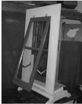
Photo: Demonstration Storm Window

Because of their short lifespan, sealed thermal units are not an efficient replacement option. A far better method for double-glazing to avoid heat loss and deaden sound is the addition of wooden storm windows. Storm windows also protect your original windows from the elements.