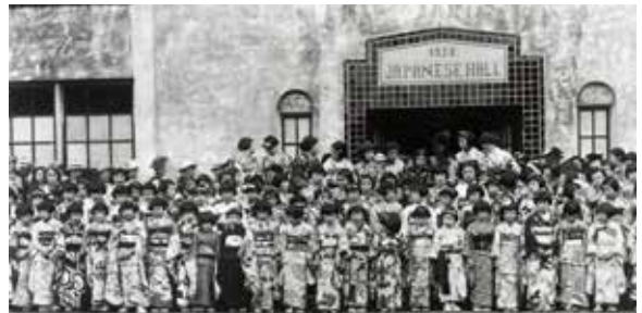
1937 Royal Visit, courtesy Vancouver Japanese Language School & Japanese Hall