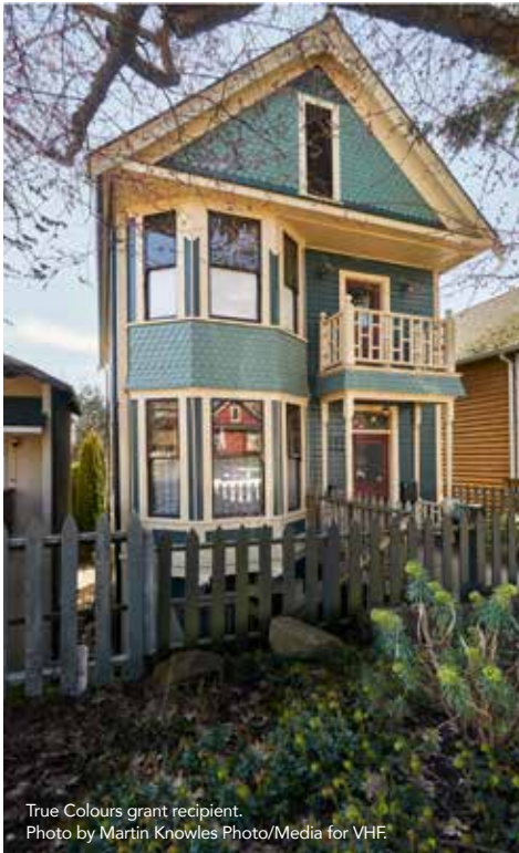
True Colours grant recipient.

VHF concluded a second phase of the Heritage Energy Retrofit Grant program, developed with the City of Vancouver Sustainability Group and City Green Solutions, and with funding support from the City of Vancouver. It offers grants and support to pre-1940 or Heritage Register homes to incentivize reductions in greenhouse gas (GHG) emissions and water conservation measures. Twenty-five homes completed retrofits under this phase of the program, achieving an average annual reduction in GHG of 3.25 tonnes (CO 2 e/year). A third phase of the program was launched in December with increased funding available per participating home and continued emphasis on building envelope improvements and greater incentive for clean energy options.