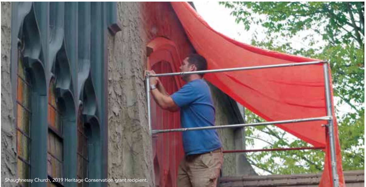
Shaughnessy Church, 2019 Heritage Conservation grant recipient.

The new program builds on twenty years of VHF's grant programs for heritage conservation projects. A new Grant Programs Manager joined the team, with the position partly funded by the program. Initial marketing included digital and media outreach as well as packages delivered to over 1,300 heritage-listed sites across the city.