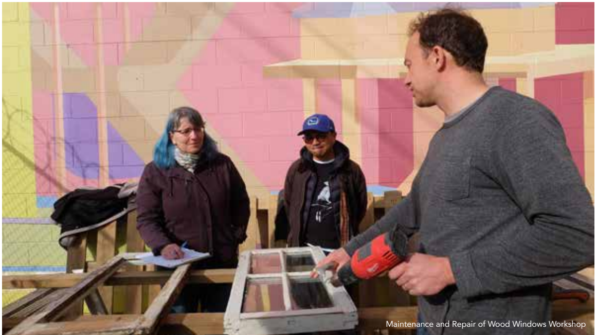
Maintenance and Repair of Wood Windows Workshop