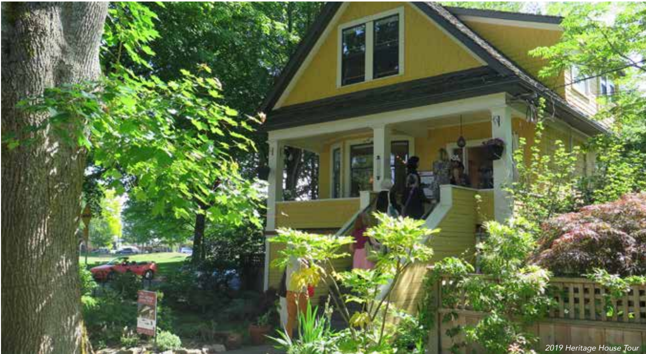
2019 Heritage House Tour