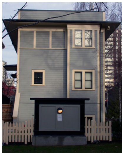
1145 Pendrell Street, New addition, 2003