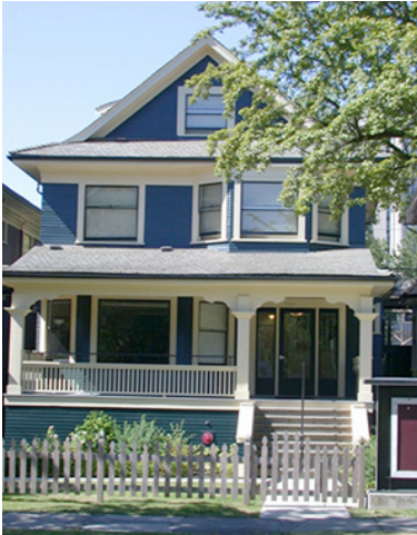
1140 Comox Street Williscroft Residence, B, 1097