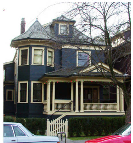
1114 Comox Street, B, 1901