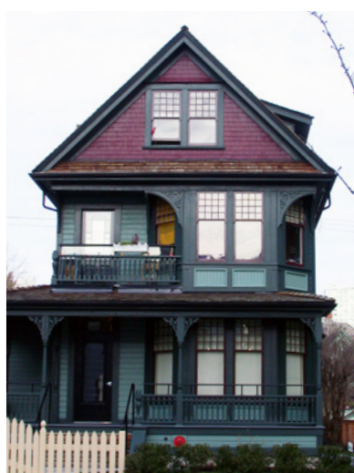
1163 Pendrell Street, B, 1898