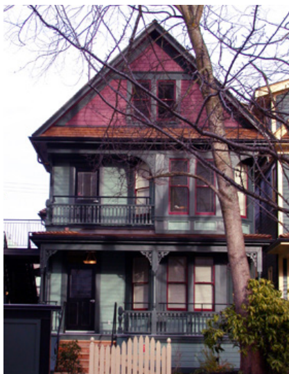
1157 Pendrell Street, Paterson House, B, 1898