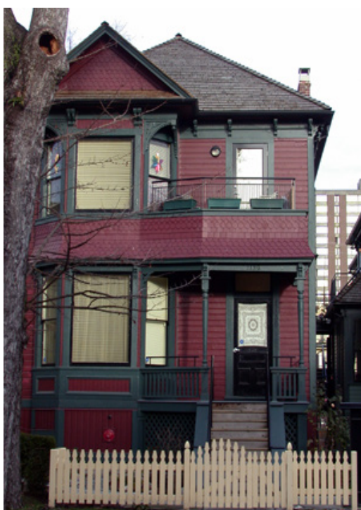
1139 Pendrell Street, B, 1889