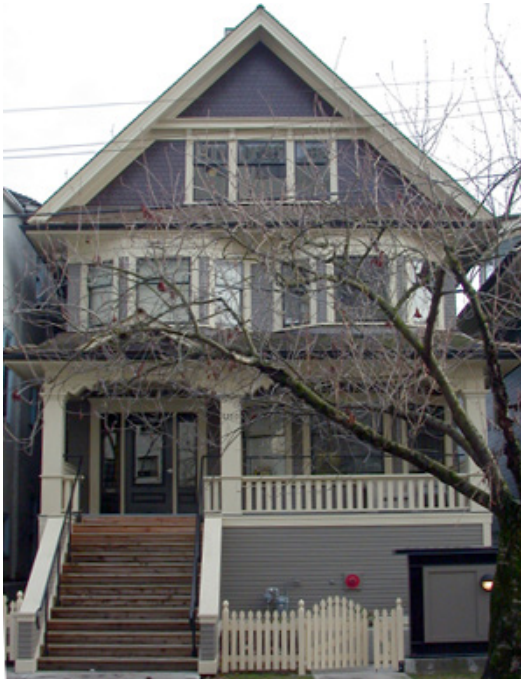
1110 Bute Street, B, 1908