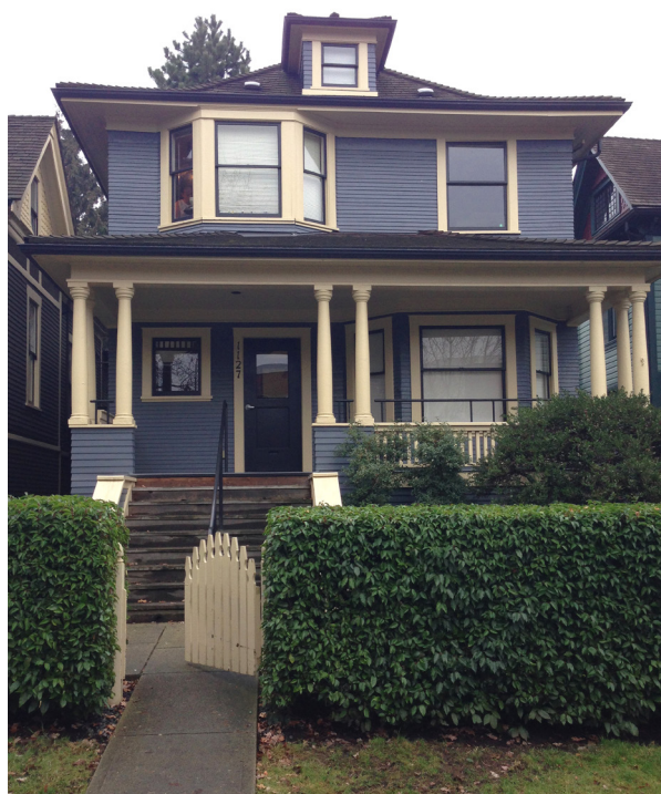
1127 Pendrell Street, B, 1904

Vancouver Heritage Foundation offer grants to assist in restoration, repair and rehabilitation of buildings and sites listed on the Vancouver Heritage Register, including restoring an authentic historical paint scheme to a house or building. Visit the VHF website for more information: https://www.vancouverheritagefoundation.org/grants/