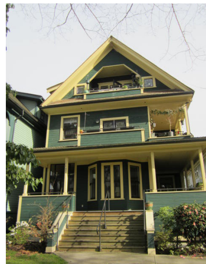
1147 Pendrell Street Ralston House, B, 1889

Vancouver Heritage Foundation offer grants to assist in restoration, repair and rehabilitation of buildings and sites listed on the Vancouver Heritage Register, including restoring an authentic historical paint scheme to a house or building. Visit the VHF website for more information: