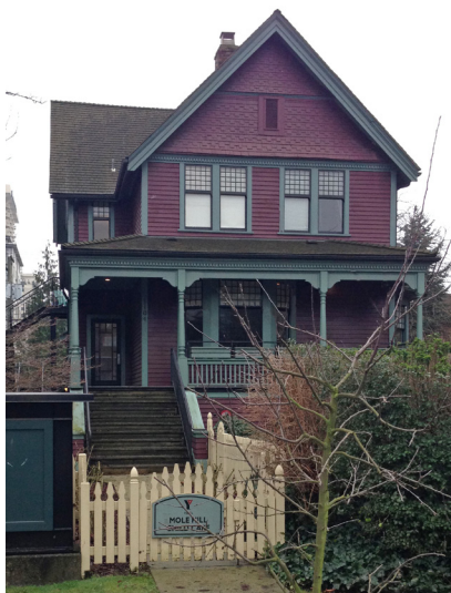
1164 Comox Street Bowser House, A, 1894-5