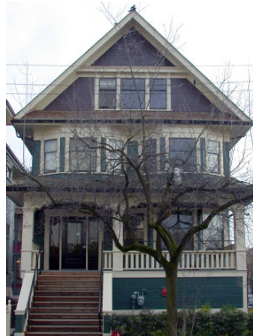
1122 Bute Street, Percy Nevil Smith House, B, 1908