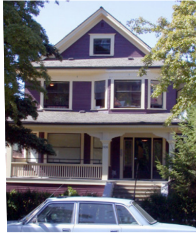
1136 Comox Street B, 1905 (est)