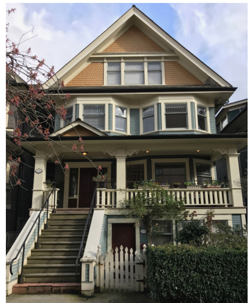
1116 Bute Street, B, 1908