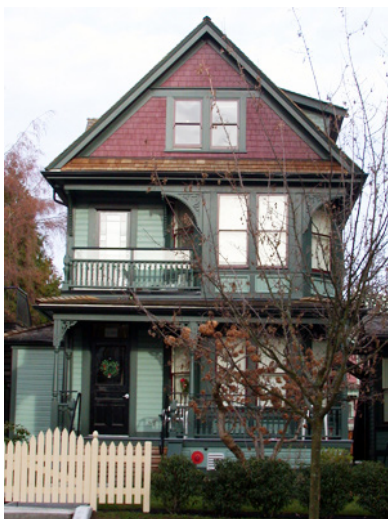
1169 Pendrell Street, B, 1898