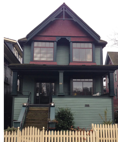
1160 Comox Street Mace House, A, 1901