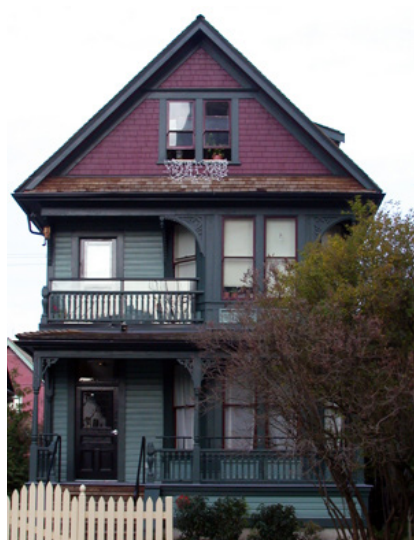
1159 Pendrell Street, B, 1898