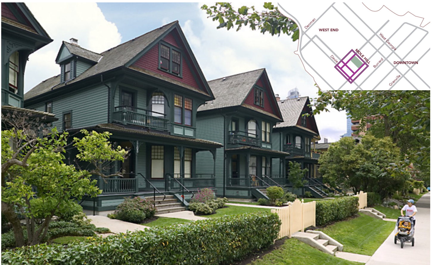
Pendrell Street Victorian houses with a palette of Pendrell Green, Pendrell Verdigris and Hastings Red.

Since 1999, many of Vancouver's heritage homes have been restored to authentic historical paint schemes that complement and illuminate the craftsmanship and details found on early architecture. Many have achieved this with the help of a grant from VHF. Visit our website for information about grants available and to find out more about the True Colours palette.