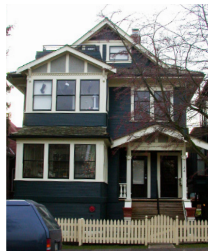
1154 Comox Street Rummel House/Braemar Lodge, B, 1906