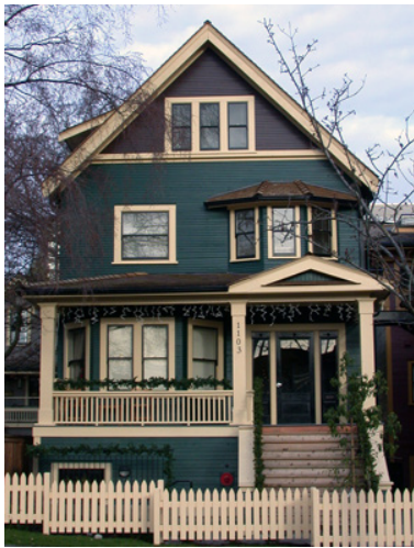
1103 Pendrell Street Costello House, B, 1907