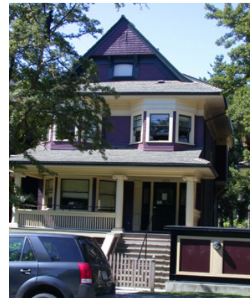
1120 Comox Street A, 1904