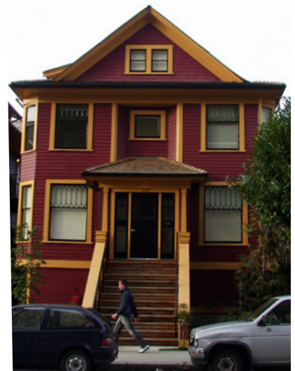
1107 Thurlow Street, B, 1903

Vancouver Heritage Foundation offer grants to assist in restoration, repair and rehabilitation of buildings and sites listed on the Vancouver Heritage Register, including restoring an authentic historical paint scheme to a house or building. Visit the VHF website for more information: