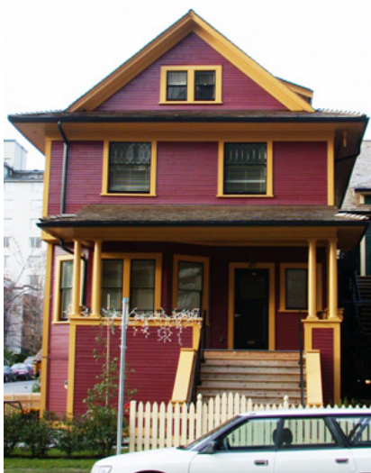
1119 Thurlow Street, C, 1903