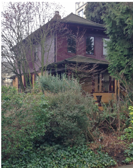
1170 Comox Street Lumsden House, A, 1901