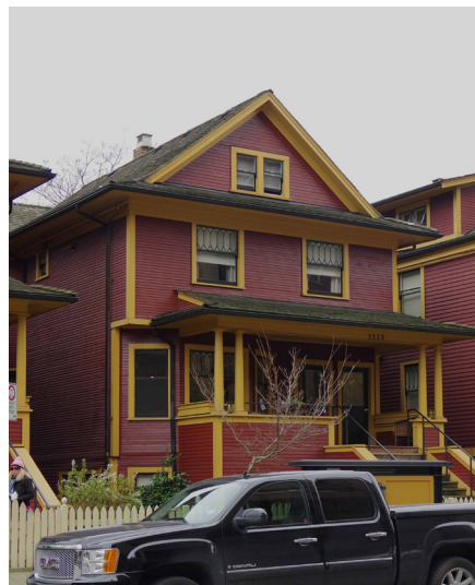
1113 Thurlow Street, B, 1903