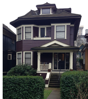
1146 Comox Street Antsie House, B, 1904

Vancouver Heritage Foundation offer grants to assist in restoration, repair and rehabilitation of buildings and sites listed on the Vancouver Heritage Register, including restoring an authentic historical paint scheme to a house or building. Visit the VHF website for more information: https://www.vancouverheritagefoundation.org/grants/