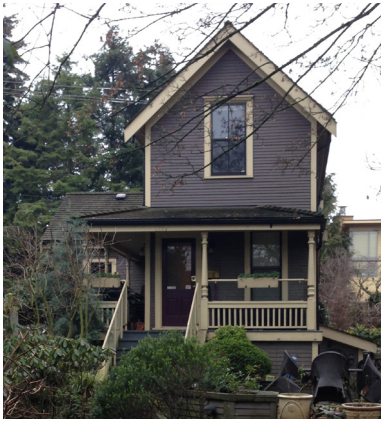
1117 Pendrell Street The Leslie Lane House Moved to Mole Hill and restored by Vancouver Heritage Foundation (now privately owned) B(M), 1903