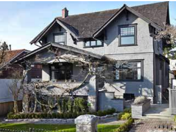
Built 1912 First Owner/Builder J.F. Gladwin Heritage Register C (contextual/character) Sponsored by