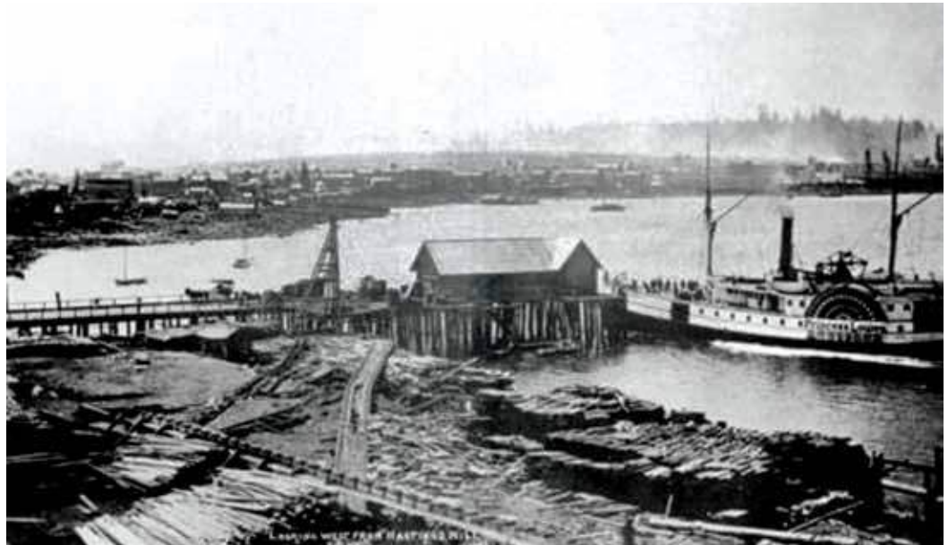
Looking west from Hastings Mill, 1886.

The two original export-oriented sawmills – Moody's and Hastings mills – closed many years ago, the former in 1901 and the latter in 1928. Although there were later generations of sawmills established on Burrard Inlet, most of the big mills operated on the Fraser