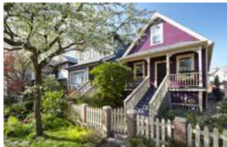
All house images provided by Martin Knowles Photo/Media unless otherwise noted